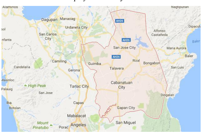
Map of Nueva Ecija

This study was conducted in the province of Nueva Ecija.