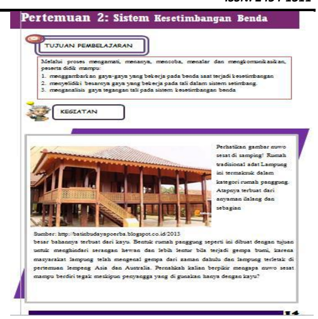
Fig.1: Student's Worksheet On Second Meeting

Table 4 shows the results of observation feasibility student worksheet overall with an average score of 92% was included in the very high category. This means that the student worksheet based Ethno science used has a step of learning activities, social system, the principle of reaction, support system, and a very good instructional impact. Learning activities using student worksheets