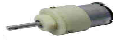
Fig. 7: DC motor

Since DC motors could be powered from existing direct-current lighting power distribution systems so they were the first type widely used in robotic vehicle. By using either a variable supply voltage or by changing the strength of current in its field windings the speed of DC motor can be controlled over a wide range. Small DC motors are used in tools, toys, and many other appliances.