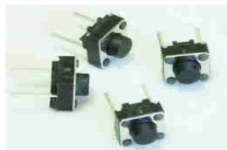
Fig. 8: Push buttons

A push-button or simply button is a simple switch mechanism for controlling some feature of a machine or a process. Buttons are usually made out of hard material, usually plastic or metal. The surface is generally flat or shaped to hold the human finger or hand, so as to be easily depressed or pushed. Buttons are generally of two types. The most often are biased switches, though even many unbiased buttons (due to their physical nature) require a spring to return back to their un-pushed state. Different terms are used by different people for the "pushing" of the button, such as press, depress, mash, hit, and punch. These pushbuttons are mandated by the electrical code in many jurisdictions for increased safety and are called emergency stop buttons.