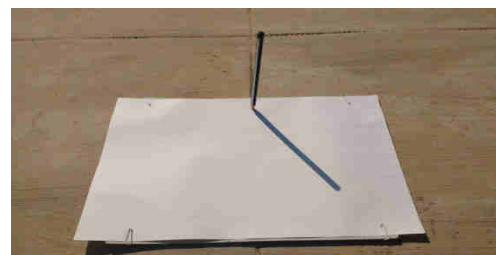
Fig. 2: Setup to measure the angles

To determine the angles that the panel had to rotate every hour, we carried out an experiment. We took a plain white paper sheet and placed a pointer vertically at the bottom centre of the sheet. We placed the setup on the terrace where sunlight was available for whole day without any shadow falling on the setup. The setup was kept in east-west direction. The shadow of the pointer at 0800hrs was taken as reference pointer and the setup was rotated so as to make the pointer shadow horizontal i.e. pointing to the west direction.