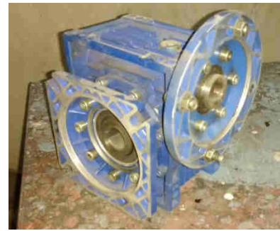
Fig. 5: Worm gearbox