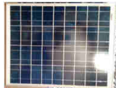
Fig. 6: Solar panel