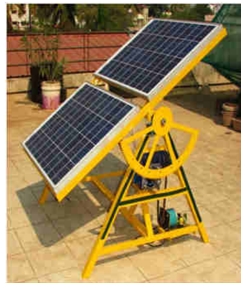
Fig.7: Photograph of Assembly of Mechanical Solar Tracking System