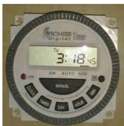
Fig. 4: Real timer