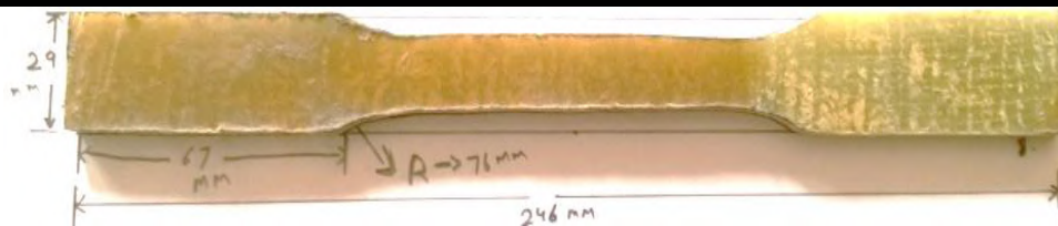
Fig.1: Tensile test specimen