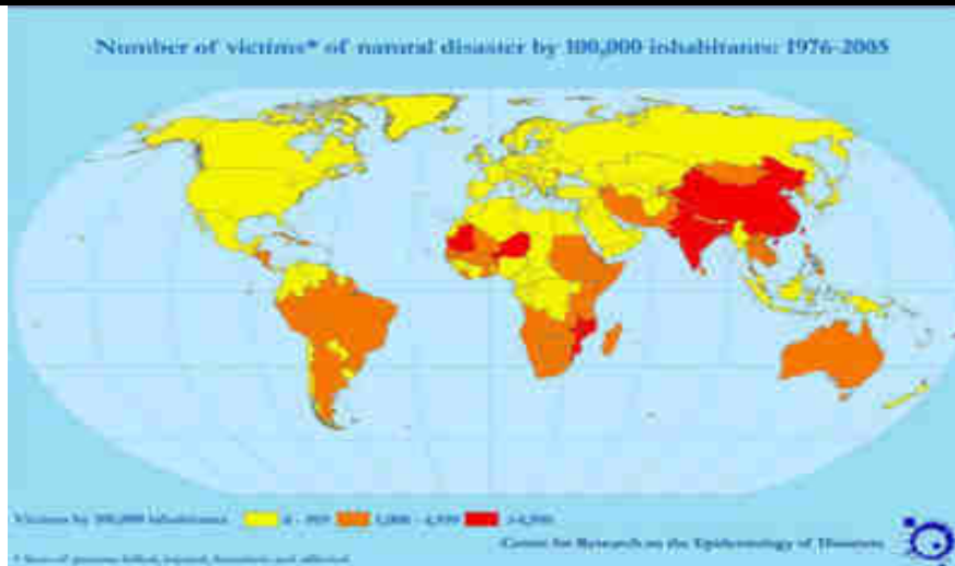
Fig.1: loss of life and property due to disaster around the world.