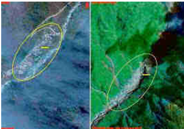
Fig.4: Satellite image of an island during disaster

This proposed method also has the storage of satellite images. These satellite images which are used to determine the geographical conditions of the particular area. It also contains the collection of images of previous disasters occurred in that particular area.