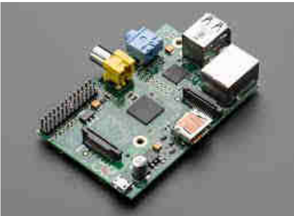
Fig.2: Image of Raspberry pi

Raspberry pi which is a hardware which is used in sensor technology, used in American army for disaster management. The raspberry pi which is highly used in sensing the geographical areas. The raspberry uses the JAVA technology in it. The disadvantage of raspberry pi is the it is highly expensive [S.Prasad,2012].