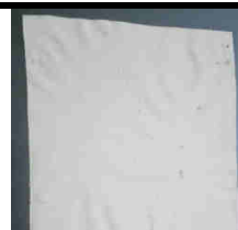
Fig. 3: Developed antimicrobial paper