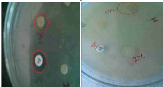
E.coli (gram negative) Bacillus subtilis (gram +)

nanoparticles solution tested i.e. 2, 4, and 8 mg. These showed clear zone of inhibition. As shown in Fig.4, But the result was negative for Bacillus subtilis . 10mg silver nanoparticles incorporation showed positive result for both gram positive and negative strain. As shown in Fig.5. These are common bacteria in food products.