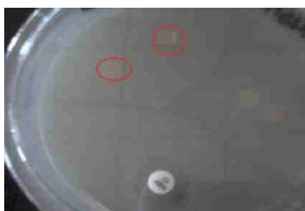
E. coli (gram negative)