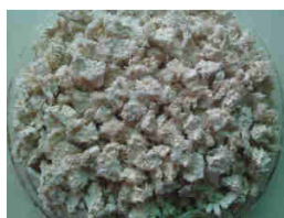
Fig. 1: Sample of chipped corn cob

Fresh samples of corn were collected from local vegetable market of Allahabad. It was cleaned to remove sand or soil after that raw material was stored at room temperature in dark to avoid moisture evaporation. Orange peel was purchased from local vendor and washed with normal water to remove dust particles then made peeling with hand and cut the peel in small size of 1- 2 cm.