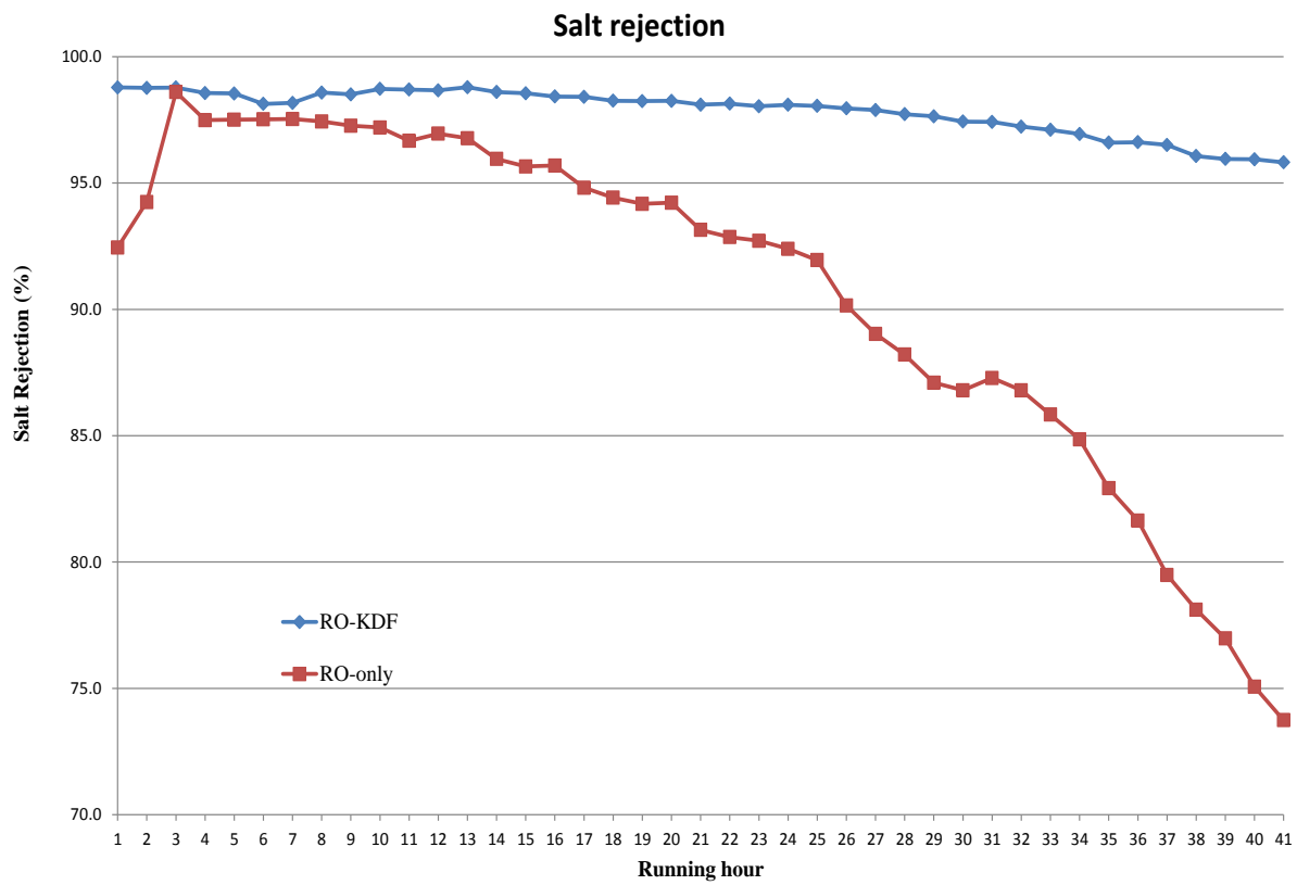
Fig.2: Salt rejection obtained by RO-only and RO-KDF systems.