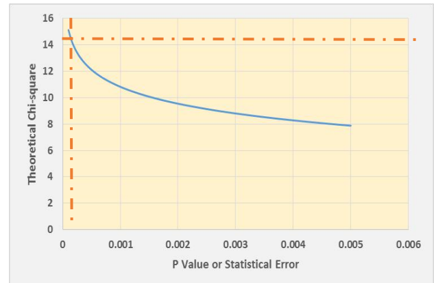
Fig.3: Graph of the theoretical inverse function: p-value vs observed chi-square, independent variable multidisciplinary work teams of 1 degree of freedom.

The intercession of p-value and observed chi-square is (0.00002354, 17.8790357). Therefore, it shows almost 100% confidence for the dependence of the variables: multidisciplinary knowledge of the individuals (independent variable) and the formation of the SDWTs (dependent variable) (Figure 2).